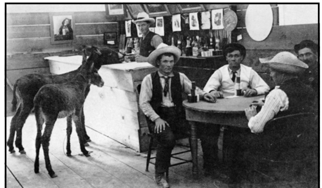
Early Las Vegas Saloon

Also in 1855, minerals and precious metals were discovered, and the State Land Act offered land at $1.25 per acre. As a result, farmers began to move in and agriculture became the predominant industry, thanks to abundant water for crop irrigation. During a mining strike in 1903, Greek immigrants began to arrive in the valley as coalmine strikebreakers, and they also migrated to work on the San Pedro, Los Angeles and Salt Lake Railroad, which laid its tracks through the Las Vegas Valley in 1904. In 1905, the railroad auctioned and sold 700 lots, creating a watering hole with a few small hotels, stores and a saloon.