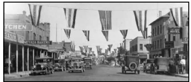
Fremont Street 1931

Presumably, since only Fremont Street was paved, Lea could keep turning left in the desert until she was headed back in the direction from which she had come.