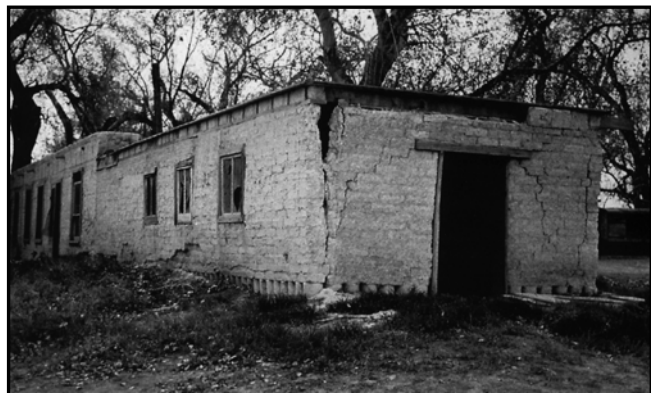
Old Las Vegas Mormon Fort

Until 1844, not much was generally known about Las Vegas until explorer and military cartographer, John C. Fremont, literally put the valley “on the map.”