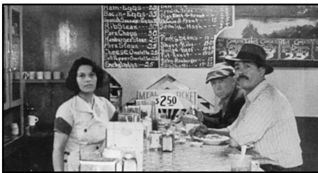
White Spot Café on Fremont Street

The year 1931 proved to be momentous in Las Vegas history, with the legalization of gambling, the start of construction on Hoover Dam, and the liberalization of divorce laws (leading to the “quickie” divorce with a minimum 6-week residency requirement). To fill the need for housing for divorce-seekers, “Dude Ranches” sprang up and became the forerunners of the fabulous “Strip” hotels.