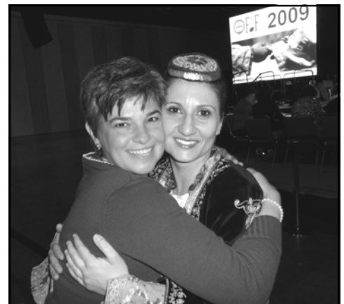
Presvytera and Bessie were very pleased with our groups at FDF!