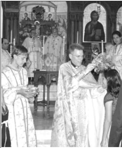
Blessing of the Church School Year on September 7.

Hi Everyone! I would like to say how wonderful the Greek Food Festival was. I was so happy to see so many of our young people working. I know that everyone worked so hard and this allowed us to have such a successful event.